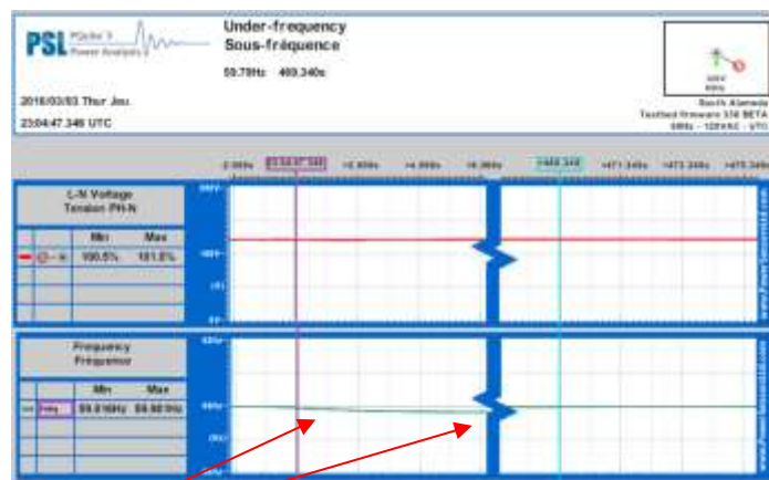
Figure 4 PQube 3 triggered and recorded an under frequency event

The sudden excursion of 200mHz over the course of just of few seconds is clearly visible.