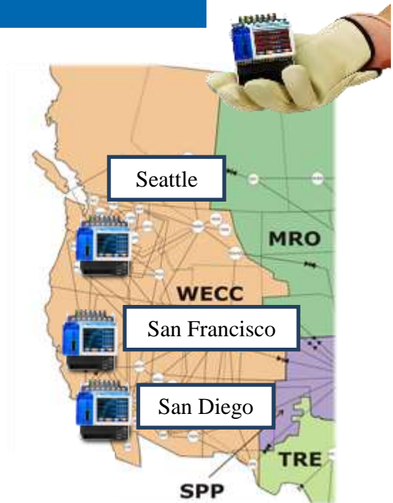
Figure 1 The Western US Transmission grid

Although frequency excursions of a few hundreds of milli-Hertz are common in islanded networks (e.g. Dominican Republic, Azores islands...), this is a rather rare event on large interconnected grids, such as in US or in Europe.